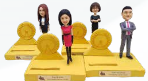
個人化陶土公仔獎座 (附咭片座) Miniyou Figurine with Logo [with Card Holder]