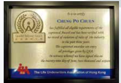
金屬證書 Metal Certificate