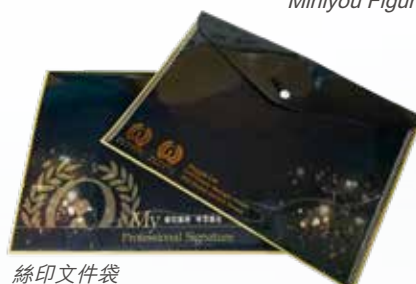
絲印文件袋 A4 Folder with Logo

In order to achieve the objectives of supporting the development of the insurance industry and uplifting practitioners' professionalism, the LUAHK established the Quality Advisor Award (QAA) and Quality Manager Award (QMA) in 2009, emphasizing the life-long commitment to "quality service, professionalism and integrity". The key objective of the Awards is to demonstrate the trustworthy and professional aspects of the awarded insurance advisors to the public, and serves as a "Q-Mark" brand accreditation to their service quality.