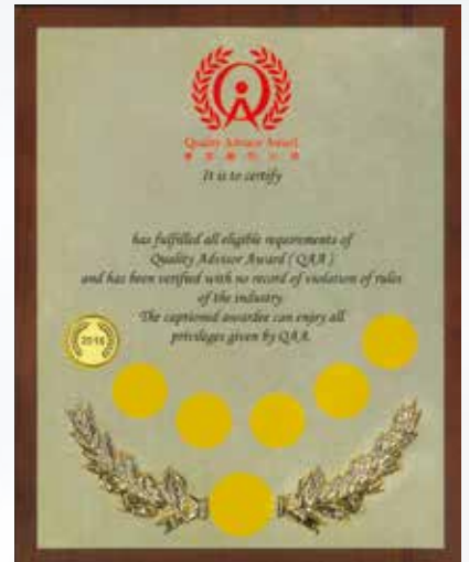
木盾證書 Wooden Certificate