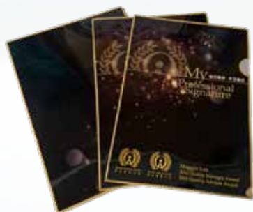
絲印文件夾 A4 File with Logo