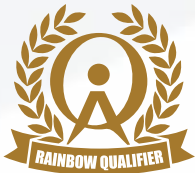
QAA / QMA / QLA Rainbow Qualifier 顧問 / 經理 / 領袖 - 彩虹獎