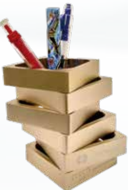
金屬百變筆筒 (刻名) Pen Holder (Name Crafted)