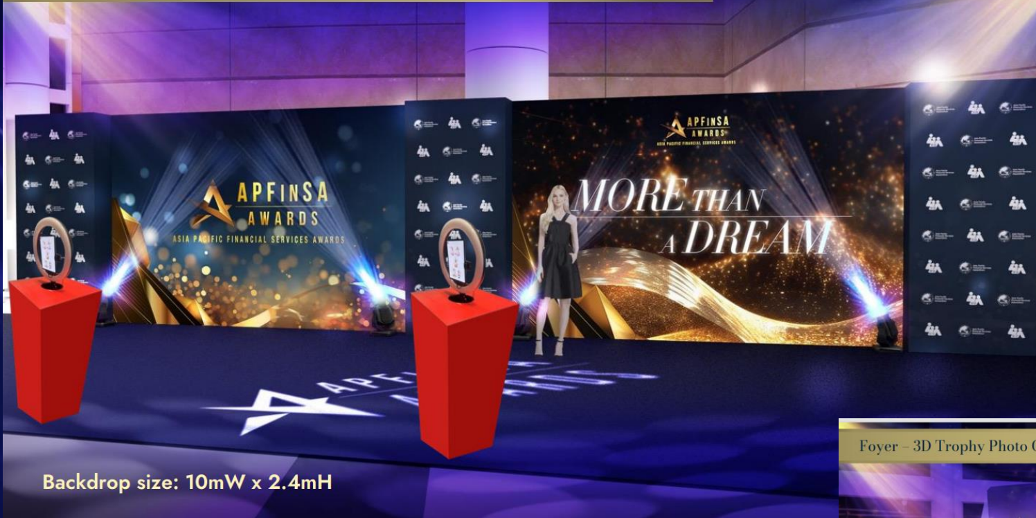
Backdrop size: 10mW x 2.4mH

14:00 – 17:00 Foyer / stage Award Presentation (short video in 1 min)