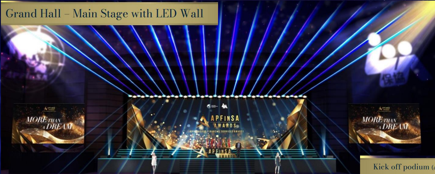
Grand Hall – Main Stage with LED Wall