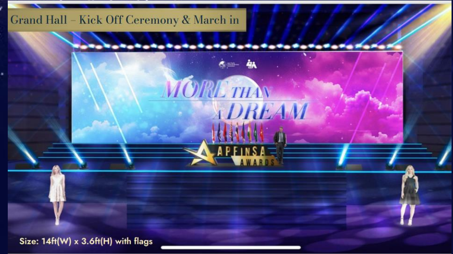
Grand Hall – Kick Off Ceremony & March in