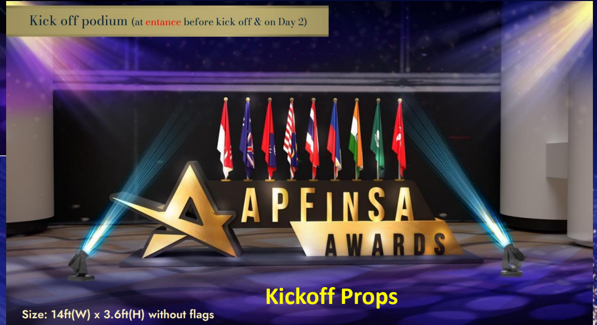
Kick off podium (at entrance before kick off & on Day 2)