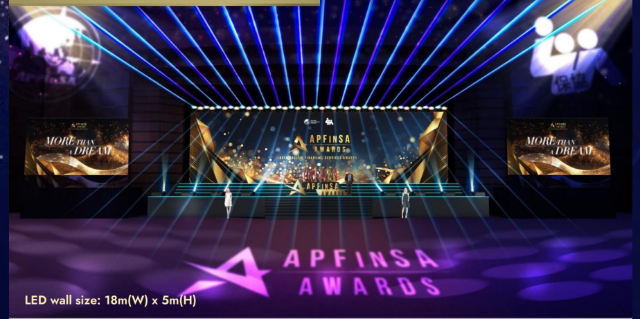
Grand Hall - Main Stage with LED Wall

17:30 – 20:30 Grand Hall / Main Stage Grand Opening & Keynote Speaker sharing