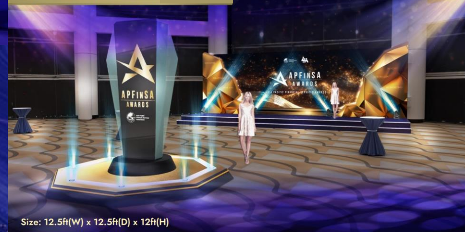
Size: 12.5ft(W) x 12.5ft(D) x 12ft(H)