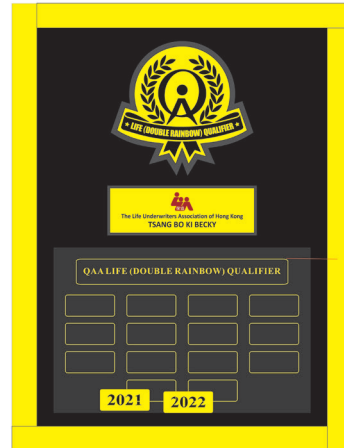
終身雙彩虹獎 Life (Double Rainbow) Qualifier