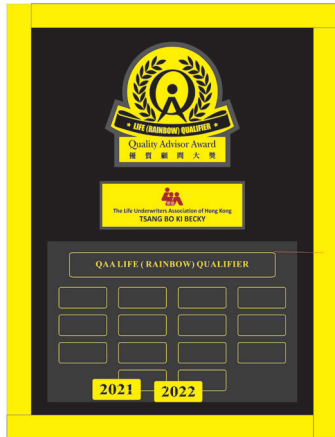
終身彩虹獎 Life (Rainbow) Qualifier

Special Souvenirs for the Awardee of Quality Advisor / Manager / Leader Award