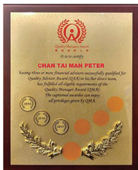
木底金屬證書（彩虹獎） Wooden Metal Certificate (Rainbow Qualifier)