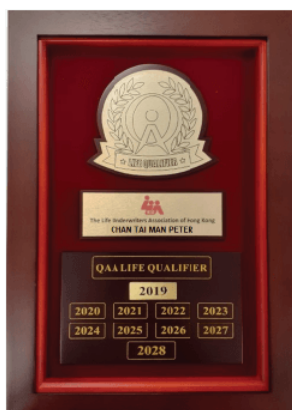
木底紅絨證書（終身獎） Wooden Red Velvet Certificate (Life Qualifier)